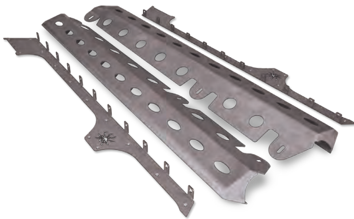
18-08-200-P1 JK 4-Dr Brawler™ Rockers (Steel) - Black SpyderShell

These installation instructions apply to the following Poison Spyder products: